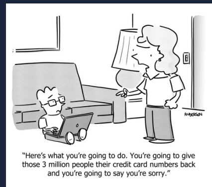
"Here's what you're going to do. You're going to give those 3 million people their credit card numbers back and you're going to say you're sorry."